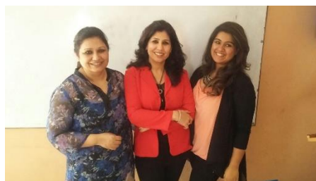
Conducting Seminars to Spread Awareness

Unlike most scholarships, this one is not merit based. It will be based on the student's financial strength, extra-curriculars and an interview. The percentage of the scholarship will be based on the interview conducted.