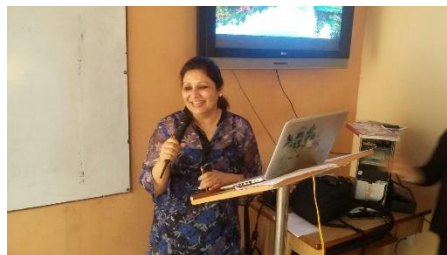
Talking to students about life in Malaysia