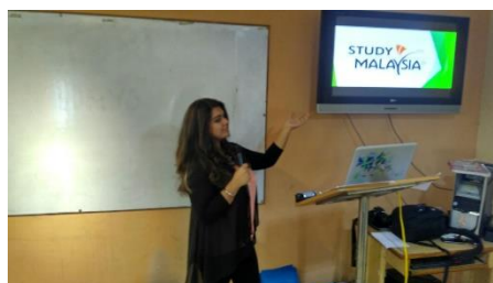
Introducing our universities